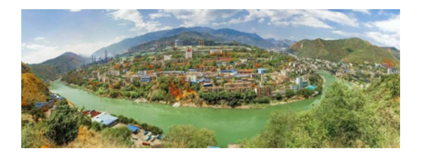
Panzhihua City, Sichuan Province